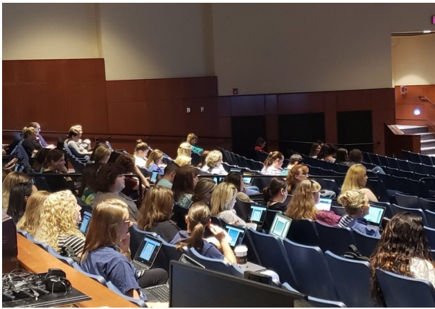
Ongoing training of our staff regarding Cultural Proficiency, Equity and Character Education is a priority in the Cherry Hill Public Schools.