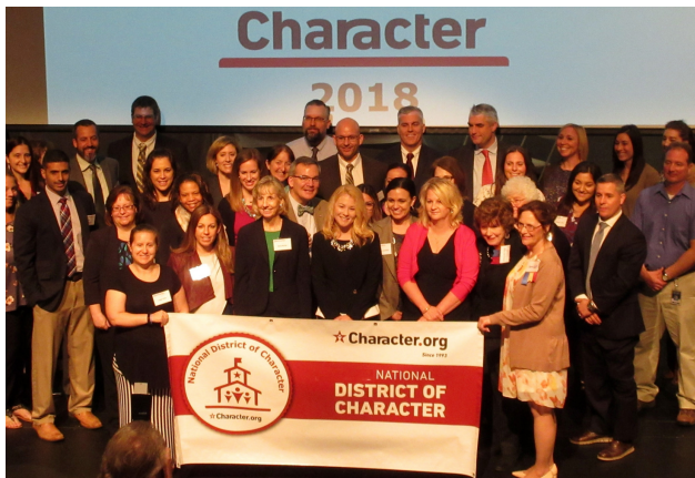
As a 2018 National District of Character, we emphasize the importance of good character among students and staff, in all of our interactions, every day.